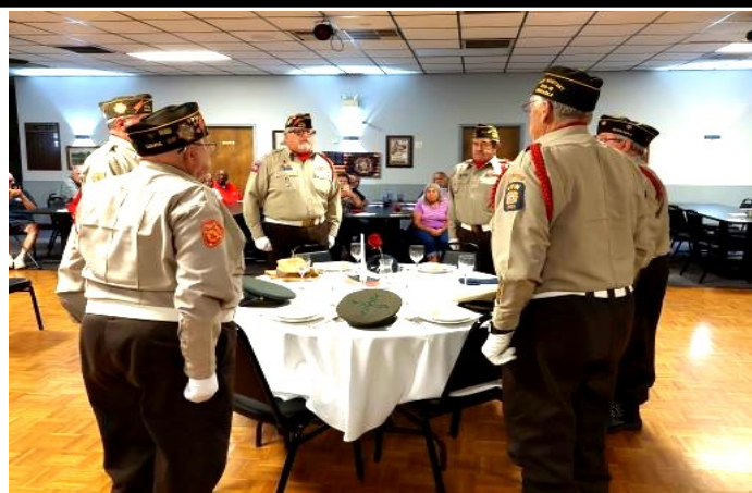
POW/MIA Ceremony at the Post on Friday, September 16