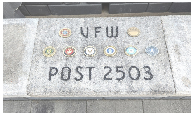
PATIO FIRE-PIT INSCRIPTIONS with EMBEDDED CHALLENGE COINS from ALL BRANCHES