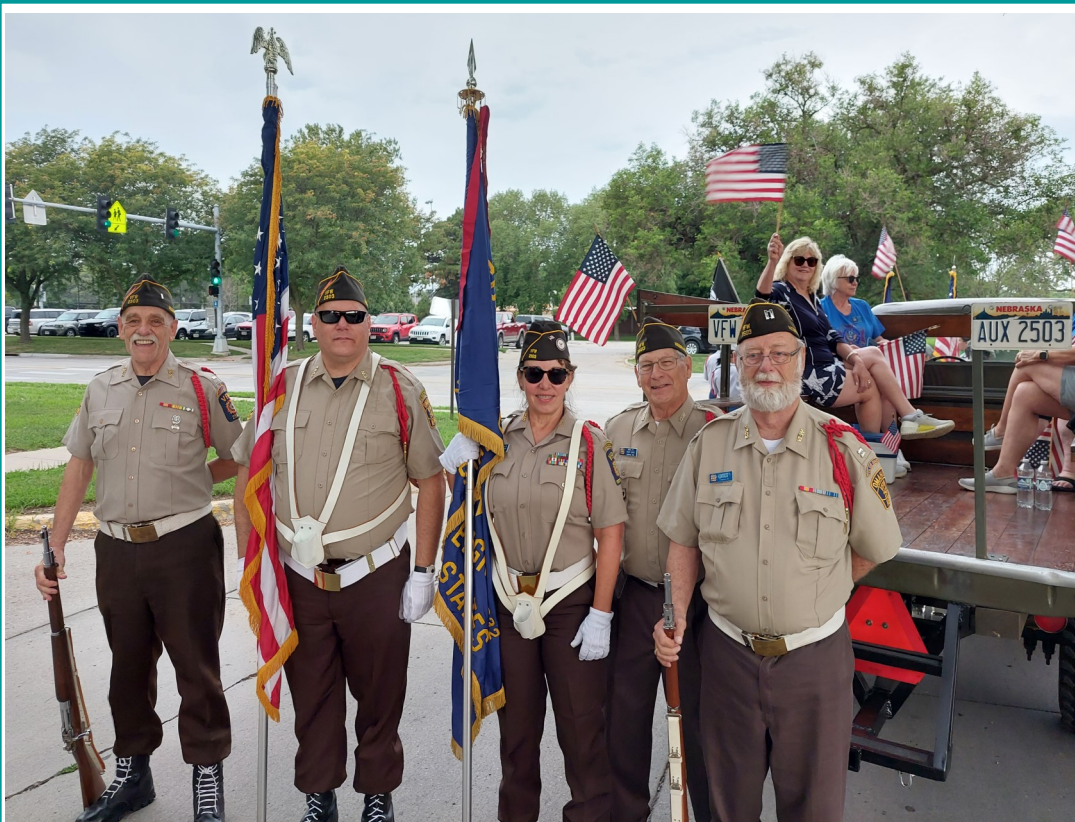
VFW POST 2503 HONOR GUARD AND AUXILIARY AT THE BENSON DAYS PARADE